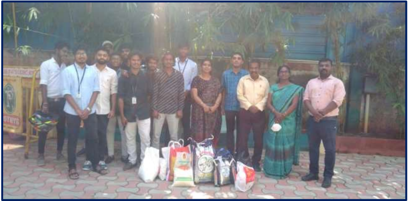
PHOTO GALLERY OF CONTRIBUTORS AND BENEFICIARIES